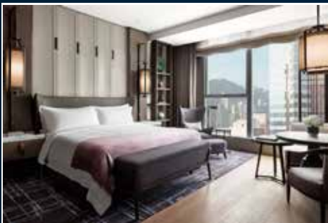
Deluxe Room City View