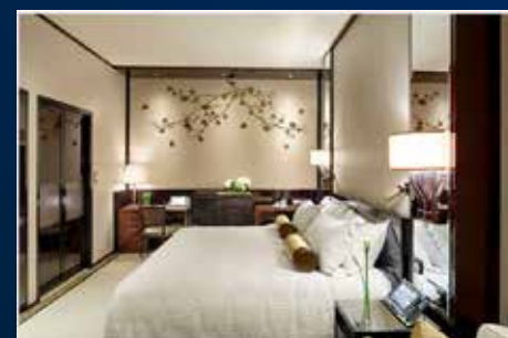
Deluxe Harbour View Suite

Last date to book CMF Special Discount Rates : May 22, 2025